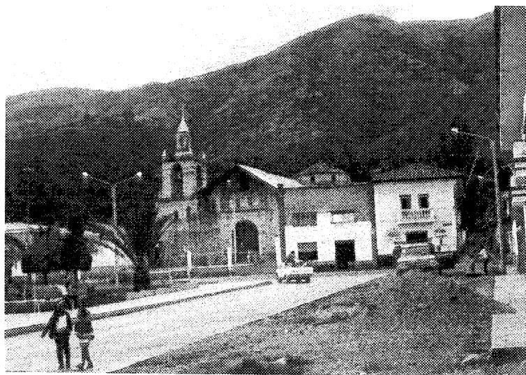
Luricocha, the second most important town in the Huanta valley and capital of the district of the same name at the time of the monarchist rebellion. In the early nineteenth century, owners of coca plantations settled here and in Huanta (a fifteen-minute drive away).