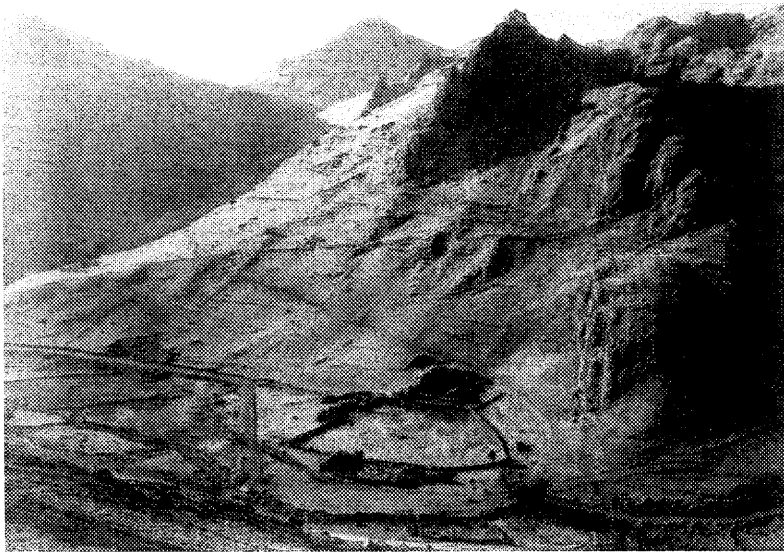
(above) The old town-casa hacienda of Uchuraccay as seen from an incline where the new town lies.

(right) Villagers assembling in the new town of Uchuraccay. Modern houses in the background were built under a special program sponsored by the Alberto Fujimori government in the late nineties.