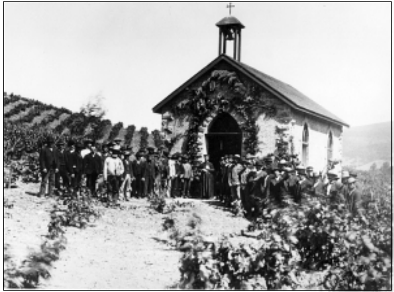
Dedication of the Chapel of the Holy Cross on Santa Cruz Island, 1891, from the archives of the Santa Barbara Historical Society.