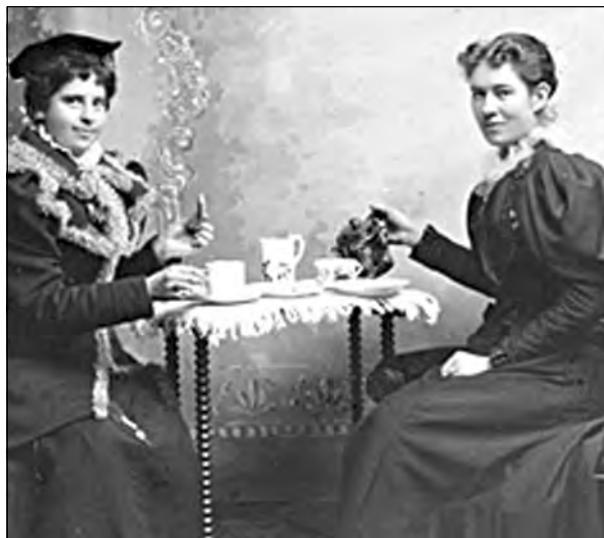
Two Victorian ladies indulge in the quintessential English pastime.

UCSB HISTORY ASSOCIATES kick off the year in fine style this month with an English High Tea on Sunday, Oct. 22 from 3 to 5 p.m. in the John Dunn Gourmet Dining Room at Santa Barbara City College.