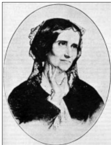
Free Love advocate Mary Gove Nichols.

Tickets for luncheon and lecture are $17 for Associates, $19 for non-members and $15 for students. Reservations can be made by phoning the UCSB Office of Community Relations, (805) 893-4388.