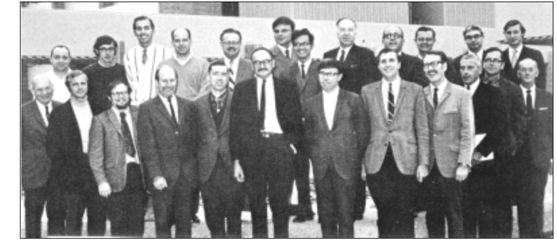
The UCSB History department in 1970. If you had a dollar for every female faculty member, how much money would you have?