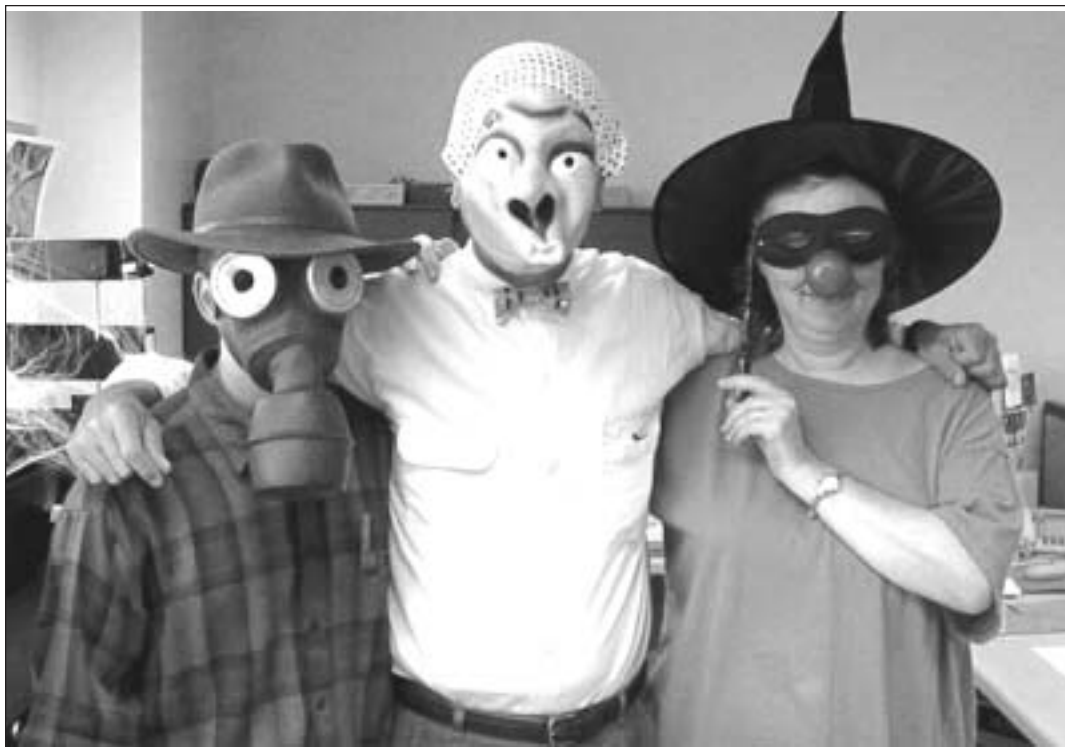
Can you identify these History tricksters? See Page Six