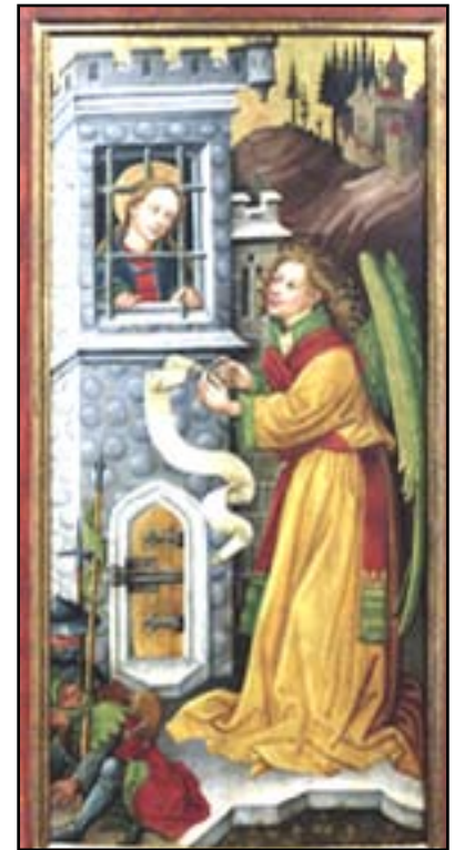
Saint Barbara in her tower. 15th century painting by the Master of the Friedrich Altarpiece.