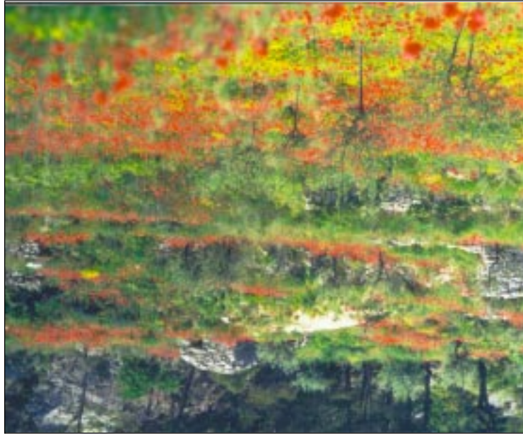
Wildflowers in Dordogne. To see them in color, go to our webpage: www.history.ucsb.edu/history/associates/baindex.htm

A sturdy VW "Golf" was hired in Brussels. Then southern France beckoned—an invitation from friends in Pau, which took us through the