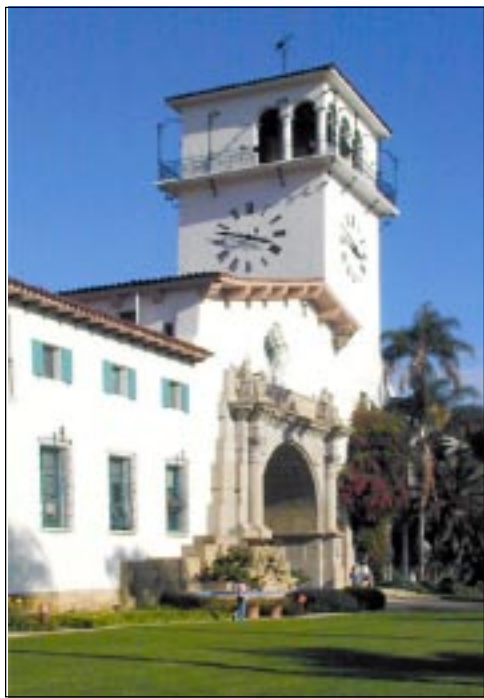
The Santa Barbara County Courthouse, built in 1929.