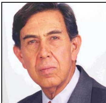
Regents Lecturer Cuauhtémoc Cárdenas.