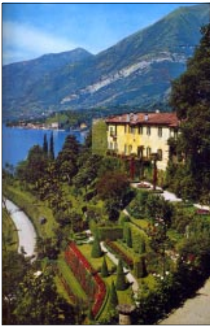
Villa Serbelloni on Lake Como