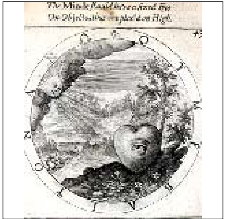
A plate from George Witber's Collection of Emblemes, Ancient and Moderne (London, 1655).

And none of this speaks to the other marvels of the Huntington—not just the gardens, which rival even Santa Barbara for an earthly paradise, but the invigorating presence of its scholarly community, which for me includes old friends as