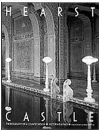
Cover of Victoria Kastner's New Book

The presentations were followed by workshops in Historic Preservation/Community history and Museum Studies, where participants got to share their on-going research, develop new contacts,