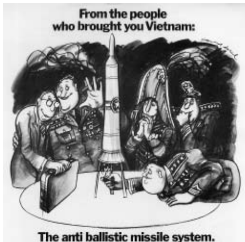
SANE Magazine Advertisement

Walter Kohn is professor emeritus in the Physics Department and a leader in the