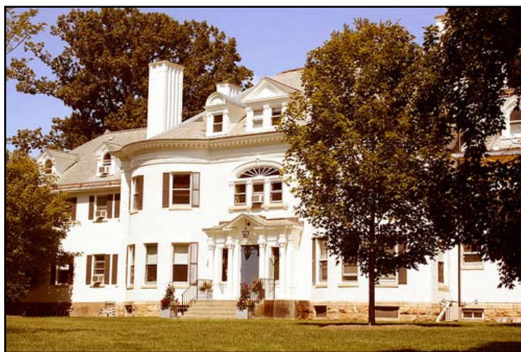
A street view of the Austen Riggs Center.

The Austen Riggs Institute dominates the one main street of Stockbridge, and it is frequently mistaken for a bed and breakfast or a small private school. But in reality it is one of the oldest continuously operating psychiatric hospitals in the country, and one of the last in our managed-care era to pursue