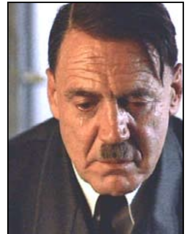
Bruno Ganz as Hitler

another, he says his class is "4B" and claims students hate learning medieval history.