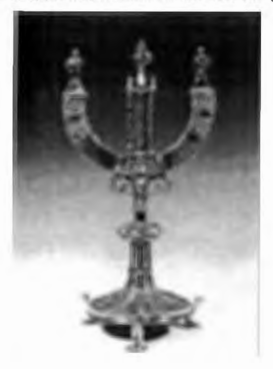
FIGURE 17.2 Hugh of Oignies. Reliquary for the rib of Saint Peter, 1238. Treasures of the Sisters of Notre-Dame of Namur. Gilded copper and silver, gemstones, rock crystal, niello.

The reliquary consists of a crescent mounted on a stand and surmounted by a transparent rock crystal cylinder lined with silk and held in place by four slender columns. The crescent shape, which evokes the shape of the relic, is decorated on this side with two nielloed plates, metal filigree, pearl, ruby, garnet, sapphire, topaz, and amethyst. The inscription on the nielloed plates reads, "IN HOC VASE HABETUR/COSTA PETRI APP."