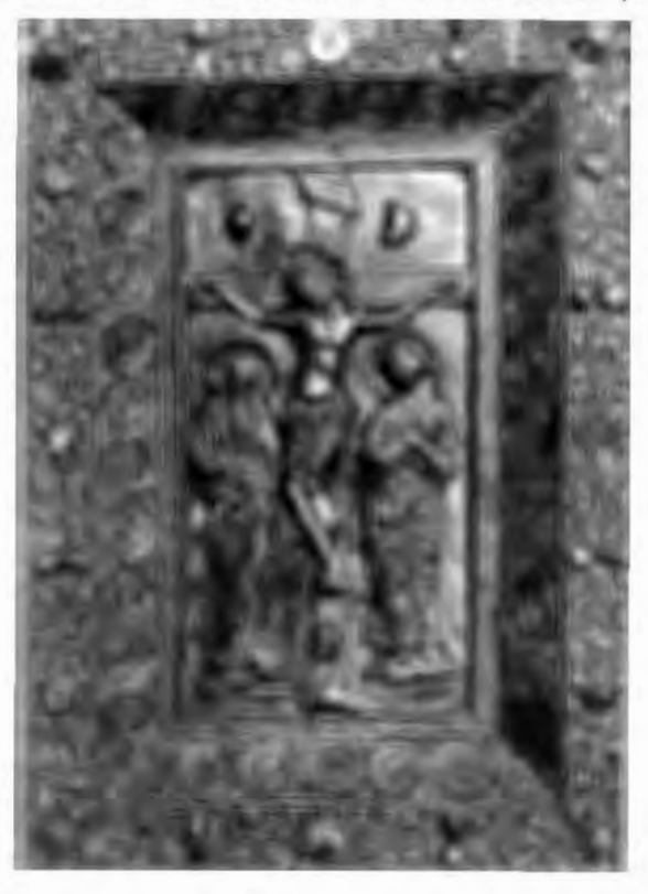
FIGURE 17.5 Hugh of Oignies. Gospel cover (back side, depicting the Crucifixion), ca. 1229–1230. Treasures of the Sisters of Notre-Dame of Namur. Wood core, silver, gilded silver, gemstones.

To the right and left of Jesus' head are a carbuncle and pearl depicting the sun and the moon. The gemstone under his feet is a sapphire, the most valued of medieval gemstones. In the border, directly over Jesus' head, is an ancient intaglio of chalcedony, which originally depicted a gorgon, but was probably intended to represent an angel in this context (there are tiny wings on each side of the head). The ancient cameo directly under Jesus' feet, made with mother-of-pearl and depicting two wrestlers, was probably intended to invoke Jesus' triumph over the forces of evil. The border is also decorated with ruby, garnet, agate, emerald, aquamarine, amethyst, pearl, and two additional ancient intaglios carved in nicolo.