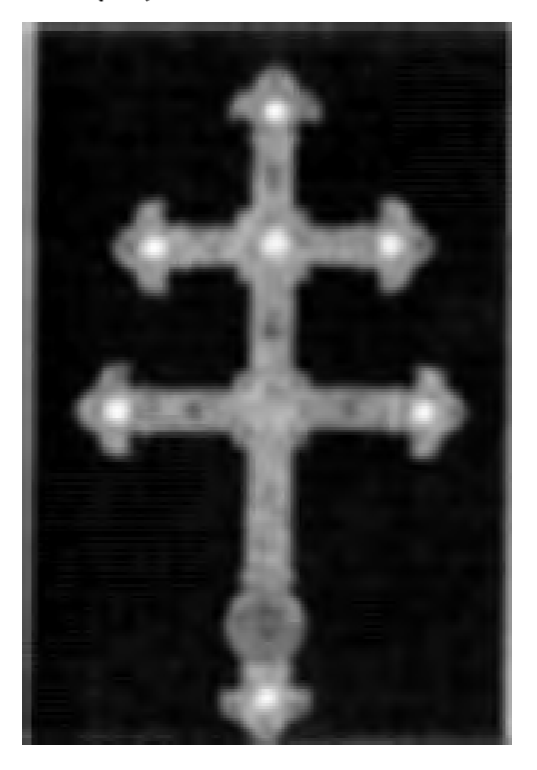
[212] THE MATTER OF PERSON

FIGURE 17.3 Hugh of Oignies. Double traverse reliquary cross for pieces of the True Cross, ca. 1228–1230. Brussels, Musées royaux d'art et d'histoire. Wood core, gilded silver, rock crystal, gemstones.