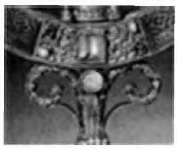
FIGURE 17.4 Detail of fig. 17.2. Hugh of Oignies. Reliquary for the rib of Saint Peter, 1238. Treasures of the Sisters of Notre-Dame of Namur.

Detail showing large topaz surrounded by two amethysts, two pearls, and filigree work depicting grapes and grape leaves. Below the topaz is a small relic custodial—a later addition—with authenticating parchment.