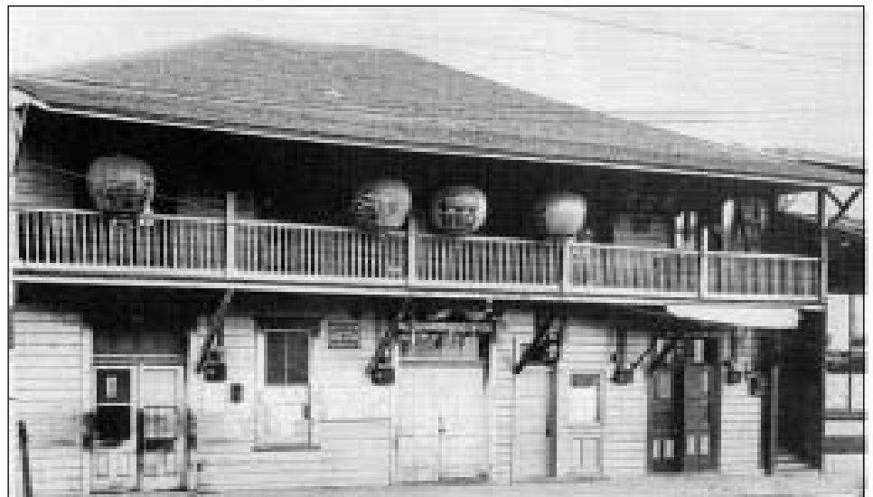
A prosperous emporium from the heyday of Chinatown in Santa Barbara