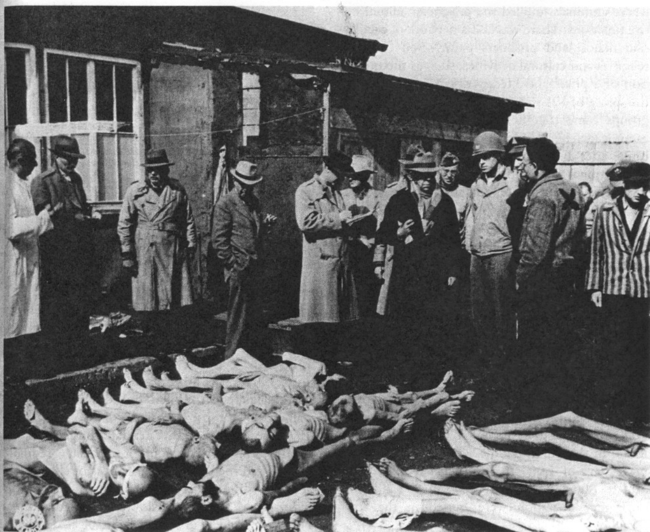
Journalists view bodies following the liberation of Dachau, May 1945. The victims shown here had been alive at the time U.S. soldiers first arrived but succumbed to disease or starvation soon afterward.

BMW plant in Allach was one of the largest external labor camps, averaging 3,800 inmates from March 1943 until the end of the war. One inmate worked for the mayor of Dachau, and two for the mayor of Munich. On 22 April 1945 there were 27,649 prisoners registered in the main camp, 37,964 in sub-camps. About 43,000 were categorized as political prisoners, 22,000 as Jews. At liberation some of the barracks, designed to accommodate 360 inmates, held nearly 2,000.