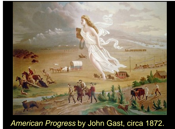
American Progress by John Gast, circa 1872.