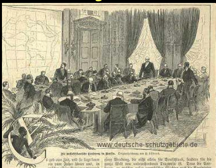
14 signatories: A-H, Belg., Denm., Fr, UK, It., NL, Port., Russia, Spain, Swed+Norway, Ottoman Emp, [US]