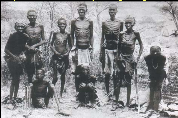
Captured Herero family during the genocide