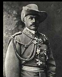
Lothar von Trotha (1848-1920)

Prussian army German East Africa China’s Boxer Rebellion