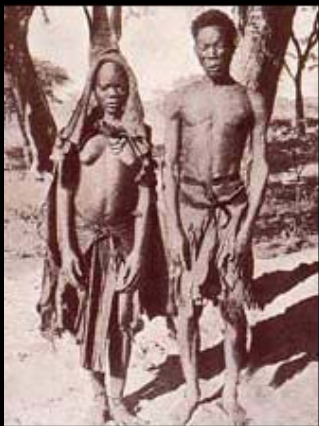
Herero couple, 1890s